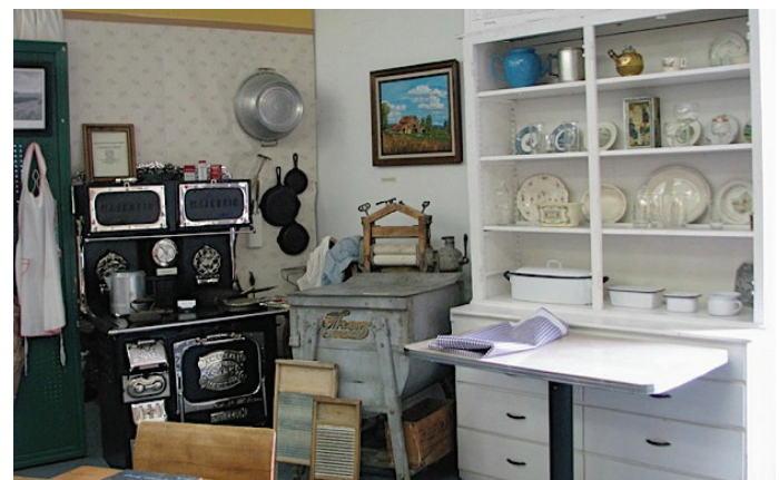
Part of the "Homestead" exhibit at the Palus Museum annex.