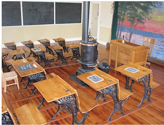
A slate chalkboard wall completes the Smith Hollow School classroom restoration.